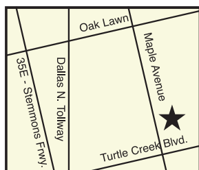
Heritage World Headquarters

THIS AUCTION IS PRESENTED AND CATALOGED BY HERITAGE AUCTIONS, INC.